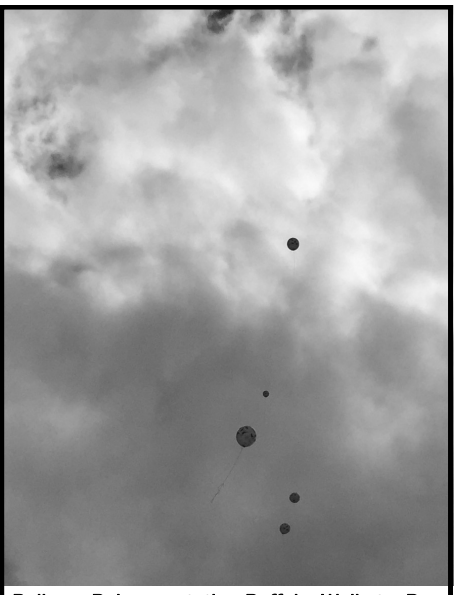
Balloon Release at the Buffalo Walk to Remember jus as the sun started to come out

There was much to experience before the memorial service began. Families could decorate their baby's signs, write notes to